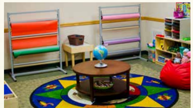
From left to right, the new carpet in the AOA, and the new children's room in the Family Services Building.